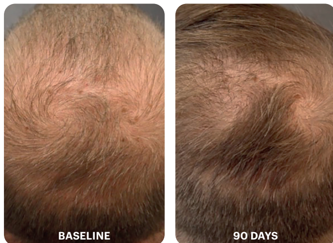
Figure 1. Hair shaft images before treatment (baseline), and after 90 days.